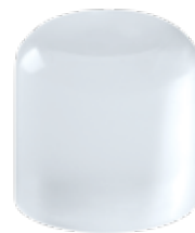
Figure 1: The CARTIVA SCI implant

The CARTIVA® Synthetic Cartilage Implant (CARTIVA SCI) is a man-made (synthetic) implant that is made of a soft plastic-like substance (polyvinyl alcohol) and salt water (saline). These materials are combined and molded into a solid, slippery and durable implant. Figure 1 shows a picture of the CARTIVA SCI. The implant replaces the damaged cartilage surface of the big toe.